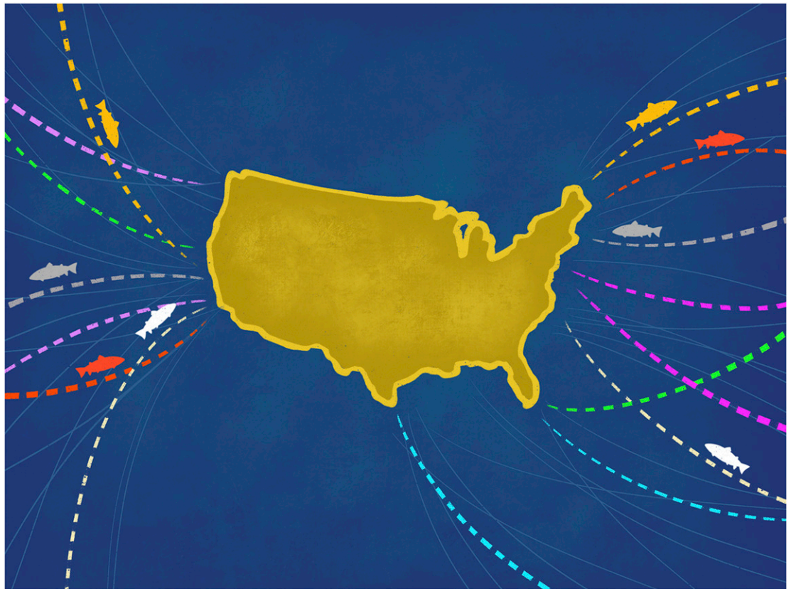
Fig. 1. A better accounting of the globalized seafood supply chain will help support the US seafood industry, achieve sustainable production, and meet consumer demand.

world's top seafood importer and among the top five exporters (2). It is often quoted that 90% of seafood consumed in the United States is imported, implying only 10% is of domestic origin. Over the past decade, this statistic has been widely shared and highlighted